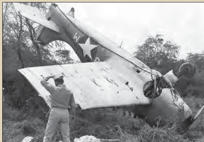
What appears to be a U.S. Navy F4F Wildcat is actually a Royal Navy Fleet Air Arm "Martlet" Mk IV assigned to No. 896 Squadron. This mishap took place near NAS Norfolk in early 1943.