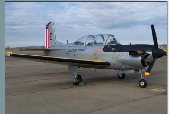
Heritage Paint 8-9