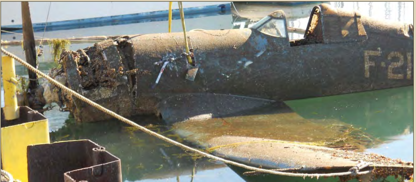
This Chance Vought F4U-1 Corsair was recovered from Lake Michigan November 8, 2010. It is a very early production aircraft and is characterized by its "birdcage" canopy. The aircraft crashed in the lake November 23, 1943. (Mark Wegge)