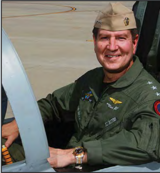
Vice Adm. Al Myers Commander, Naval Air Forces

The headquarters building for Naval Air Forces is located on Naval Air Station North Island - the site where young men came together 100 years ago to learn the craft of powered flight. Under the tutelage of aviation pioneer Glenn Curtiss, Navy Lieutenant Theodore Ellyson became the Navy's first Naval Aviator, learning to fly on a 4-cylinder machine that the flight students called Lizzie. From austere beginnings, Naval Aviation has evolved into a centerpiece of American military might, capable of influencing events around the globe with little advance notice.