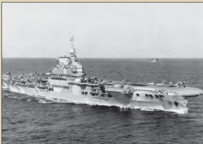
HMS VICTORIOUS during operations in the Mediterranean Sea during 1941. In 1943, she would operate with the U.S. Pacific Fleet under the code name USS ROBIN.

VICTORIOUS remained in service through 1968 before being decommissioned. Her assignments in the Pacific are a true testament to the spirit of coalition operations that endures to this day.