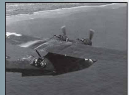
Black Cats 14

COVER: “USS SARATOGA (CV 3)”, Oil on canvas; 1928 (Navy Art Collection 28-001-A) . The original artwork was painted by artist Walter Greene and illustrates the SARATOGA in her first year of operation.