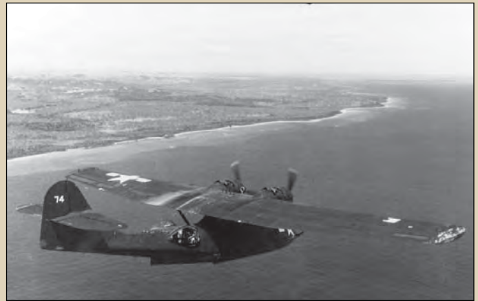
This VP-52 PBV-5 "Black Cat" heads out for another night's work, somewhere near New Guinea in December 1943. (Mark Aldrich)

"It was a bright moonlit night with exceptionally good visibility. In order to avoid detection, we flew the last 150 miles at 20 feet above the water in a tight formation. (Lt.) Jack Coley was the lead