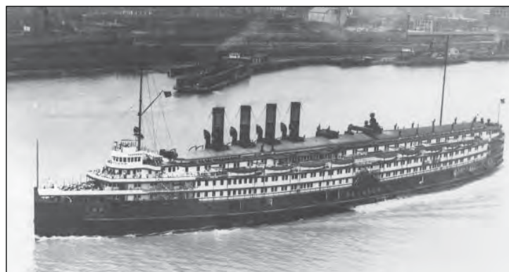
The Great Lakes paddlewheel steamer "Seeandbee" before conversion to USS WOLVERINE.

After VJ Day, both ships had accomplished their missions. They were decommissioned in November 1945 and transferred to the U.S. Maritime Commission, which sold them for scrap in 1948. Their contribution in training Navy and Marine Corps aviators was invaluable and led the way to victory in WWII. The USS SABLE and USS WOLVERINE are a very unique chapter in the history of naval aviation, and remain the only paddle-wheel propelled, freshwater operated, aircraft carriers ever operated by the U.S. Navy.