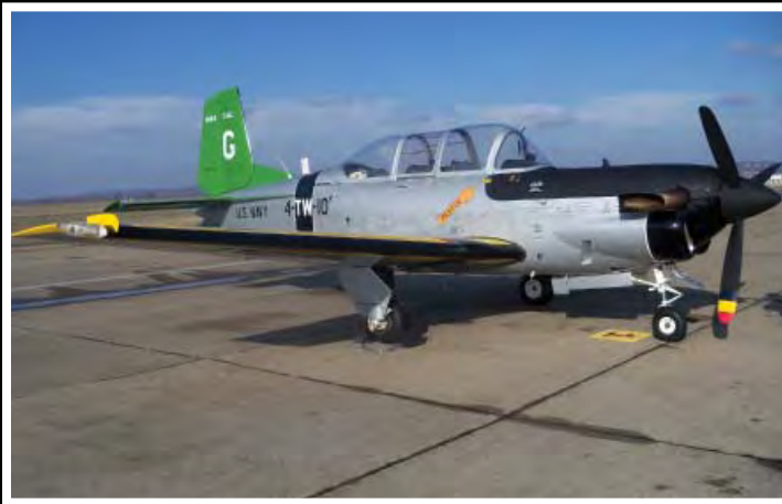
(Left) T-34C (BuNo 161841) in the markings of USS RANGER (CV 4) circa 1936. It was painted by Sabreliner Corporation in Perryville, Mo.