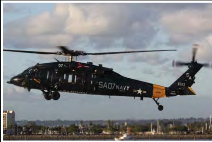
MH-60S (BuNo 166323) is assigned to HSC-3 at NAS North Island. It is painted in the markings of fleet helicopters from 1947 to 1956. (Capt. Rich Dann)