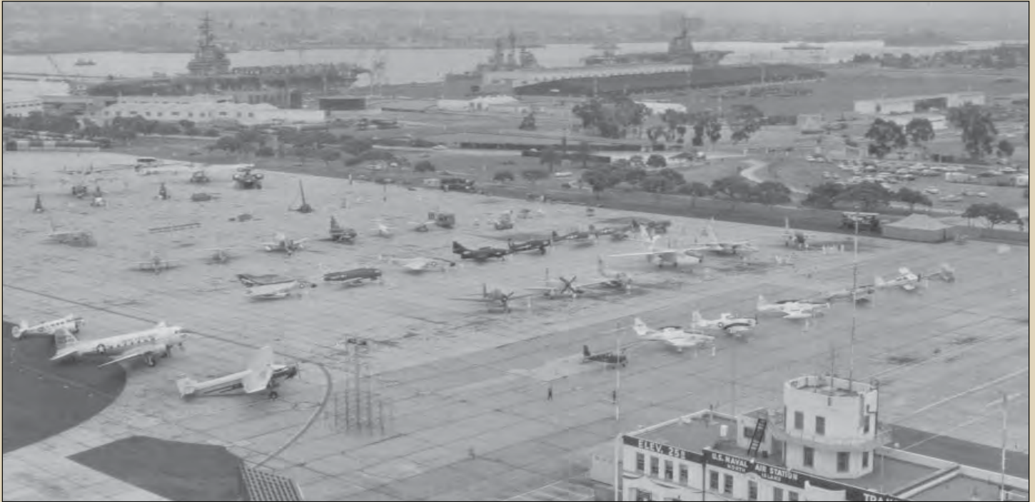
This 1961 photo shows the transient flightline at Naval Air Station North Island in preparation for the 50th Anniversary of Naval Aviation. Examples of many Naval aircraft attended. Numerous vintage aircraft will take part in the 100th Anniversary celebration.

February 17, 1911, inventor and aviation pioneer Glenn Curtiss taxied his “hydroaeroplane” to the cruiser USS PENNSYLVANIA anchored in San Diego Bay. It was hoisted aboard the ship and then lowered back into the water and Curtiss returned to North Island. This historic event, more than any other, prompted the Secretary of the Navy’s decision to purchase the Navy’s first aircraft.