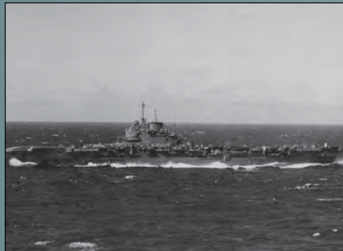
USS ROBIN 12