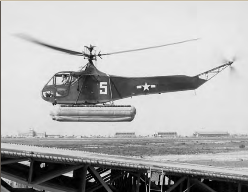
A Coast Guard HNS-1 Hoverfly pictured during tests on a rocking platform simulating a rolling ship deck that was constructed at Coast Guard Air Station (CGAS) Brooklyn (Floyd Bennett Field), New York, 19 May 1944.

Floyd Bennett Field, Brooklyn, N.Y., figured prominently in the early development of aircraft and helicopters. The field was named after Floyd Bennett, born in Warrensburg, N. Y. Bennett enlisted in the Navy for flight training in 1917 and later served as a test pilot and as Chief Machinists Mate aboard USS RICHMOND in charge of aircraft.